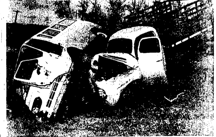
TRUCKS COLLIDE... Wayne Man Injured