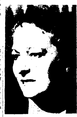
DR. BELLA DODD

A former official of the Communist Party, USA, will give a guest lecture Wednesday on Communist infiltration into education at the Wayne city auditorium. Starting at 8 p.m., Dr. Bella Dodd, former party organizer for the Communists, will give her views and past experiences with Communism and education. Dr. Dodd, now a practicing New York attorney, taught political science at Hunter College from 1925 to 1938, serving a legislative representative for the American Federation of Teachers and New York State Federation of Teachers. She joined the Communist party in 1932 and was an active member until 1948. She served as legislative representative for the Communist party of New York from 1944 to 1948. Following her break with the party, she testified before the Senate Internal Security Committee of the House Un-American Activities Committee State Rules Committee-Department of Justice. She returned to her church in 1952 and is the author of School of Darkness. She then taught at St. John's Law School from 1955 to 1961, re-